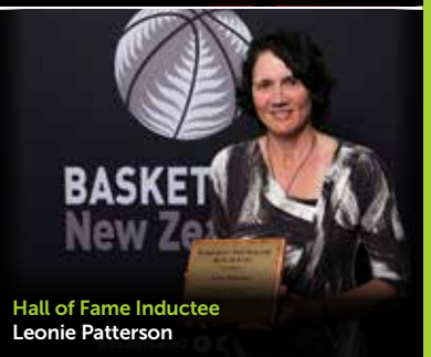
Hall of Fame Inductee Leonie Patterson