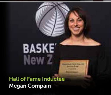
Hall of Fame Inductee Megan Compain