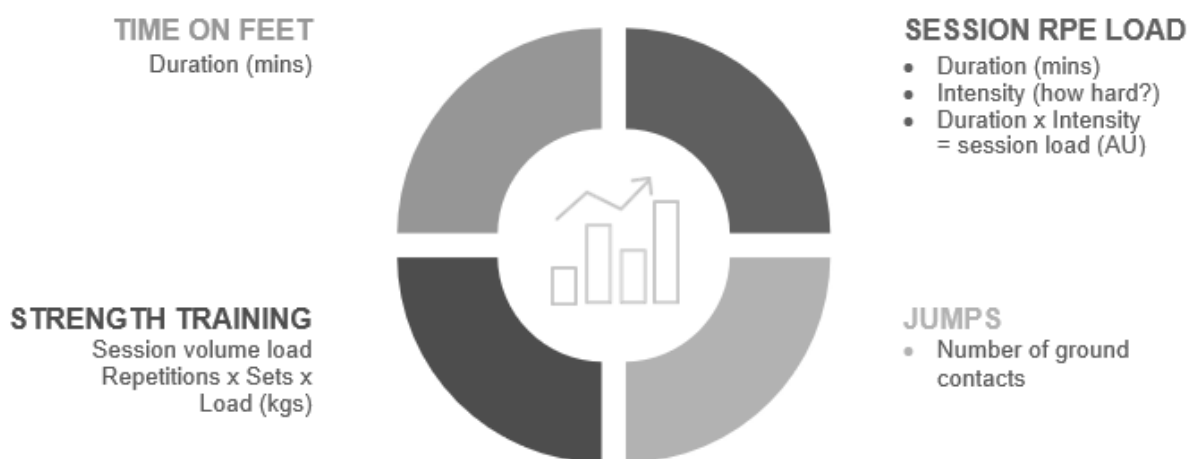
Figure 1. Methods of quantifying training load for various training modalities.

In light of concerns surrounding the physiological and psychological demands associated with a condensed NZNBL season, and the potential injury risk during retraining, 14 load management, although a controversial issue across elite sport, is a primary consideration for game and training dose decisions, 8 and can be quantified by various methods (see Figure 1). Progressive overload is the gradual and systematic increases in training load to maintain and/or, achieve continued positive training adaptation. 10 The rate of progression is an extremely important consideration; as progressing too rapidly can result in injury while progressing too slowly will delay fitness gains.